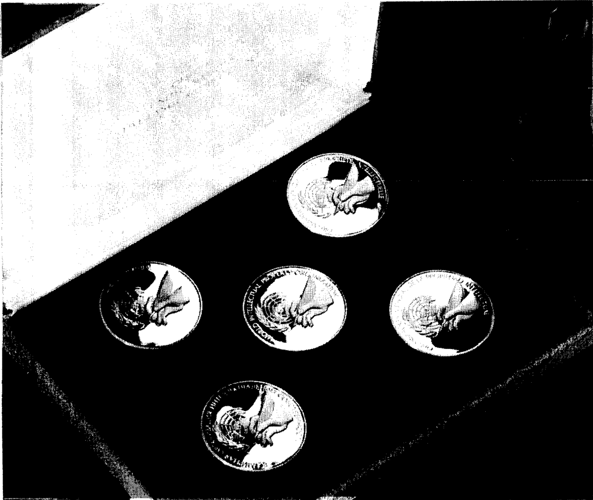
Illustrated actual size is the official United Nations Five-Language Proof Set to be issued on March 11, 1977, honoring the World Intellectual Property Organization.

It is the official policy of the United Nations to strike each new commemorative medal in five versions—one in each of the official languages of the UN: Chinese, English, French, Russian and Spanish. The Medallion First Day Covers issued to collectors in the United States contain the English-language version. Sterling silver Proofs in all five languages are available only in the complete Five-Language Proof Sets. Thus, the only collectors to receive all of these commemorative medals during the coming year will be the subscribers to the 1977 Five-Language Proof Sets.